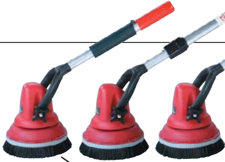
MS1000-HH Hand-Held MotorScrubber 15"