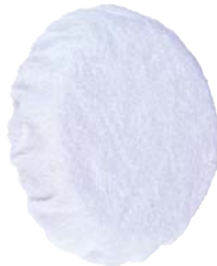
MS1042 Terrycloth Bonnet