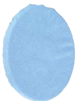
MS1052 Thin Microfiber Bonnet