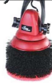
MS1048 Baseboard Brush