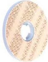
MS1046 Padholder Disk