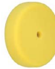
MS1030 Sponge Disk