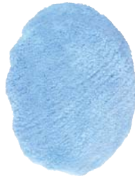
MS1050 Thick Microfiber Bonnet