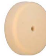
MS1040 Wax Applicator