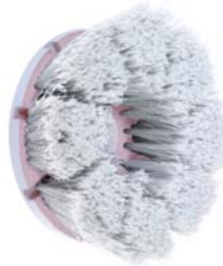
MS1044 Flagged Tips