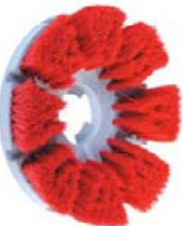
MS1041 Medium-Duty Brush