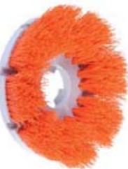
MS1039-P Aggressive-Duty Brush