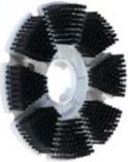
MS1038 Light-Duty Brush