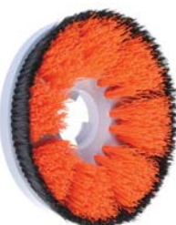
MS1039-SG Aggressive-Duty Brush with "SplashGuard"